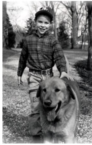
For the Future